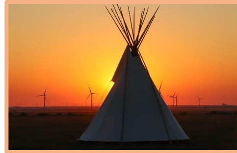
Medicine Mound Sunset