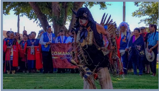
Medicine Mound Courthouse