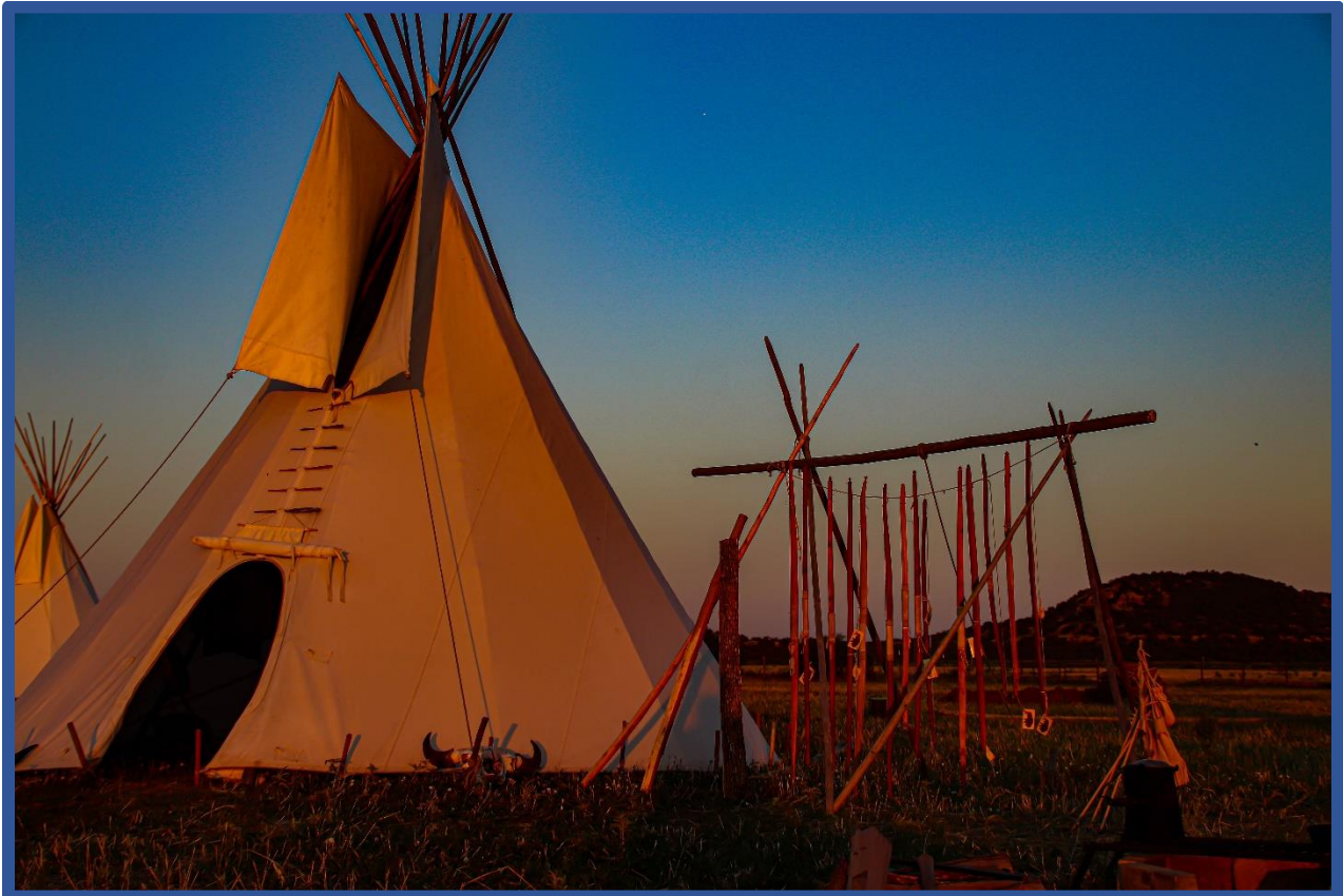
Gathering at Medicine Mound Comanche Strong, June 2021