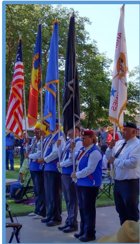
Medicine Mound Courthouse

The history of the Comanche Nation and Palo Duro Canyon as well as the history of the Llano Estacado and its other native peoples are closely interwoven. Near the entrance to Palo Duro Canyon State Park is a giant arrow implanted to mark the travels of the Comanche throughout the Panhandle and South Plains, especially that of Quanah Parker, the most well-known of the Quahadi Comanches. Cf