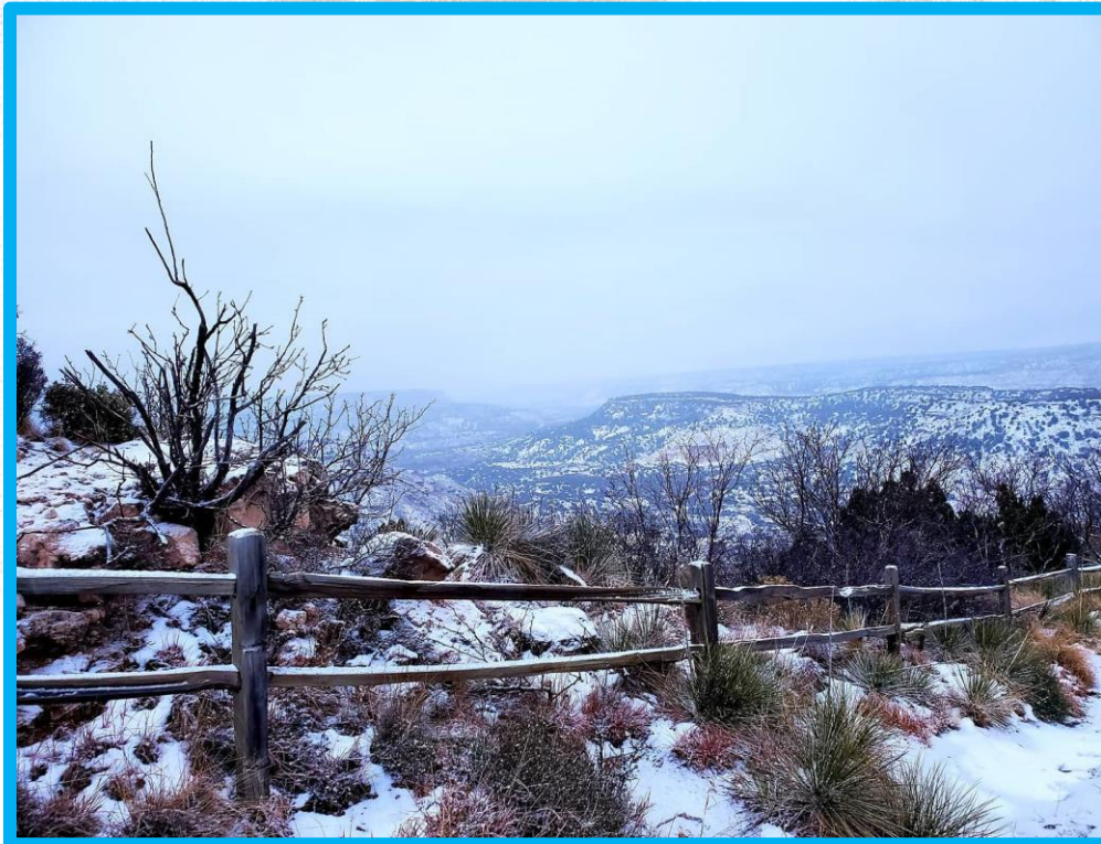
The Great Freeze of 2021