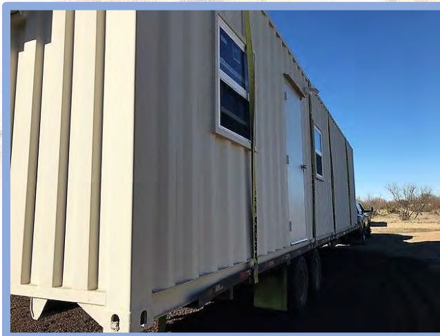
Office in Place