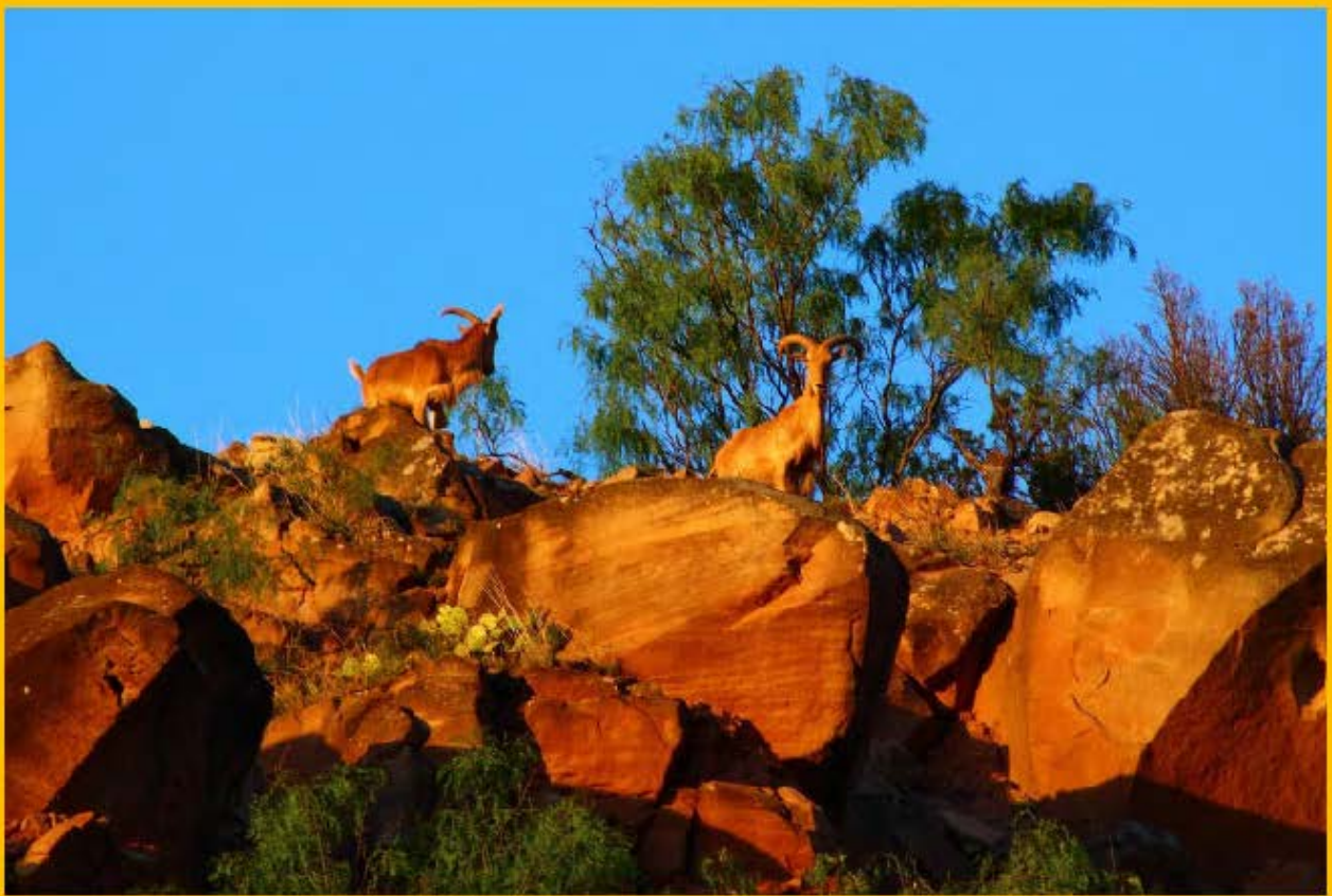
Aoudad Sheep in Palo Duro Canyon