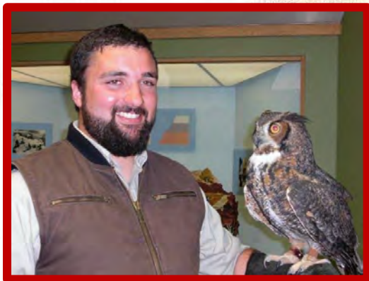
Jeff Davis New Portable Office Building

Palo Duro Canyon State Park exists to conserve the natural and cultural resources of