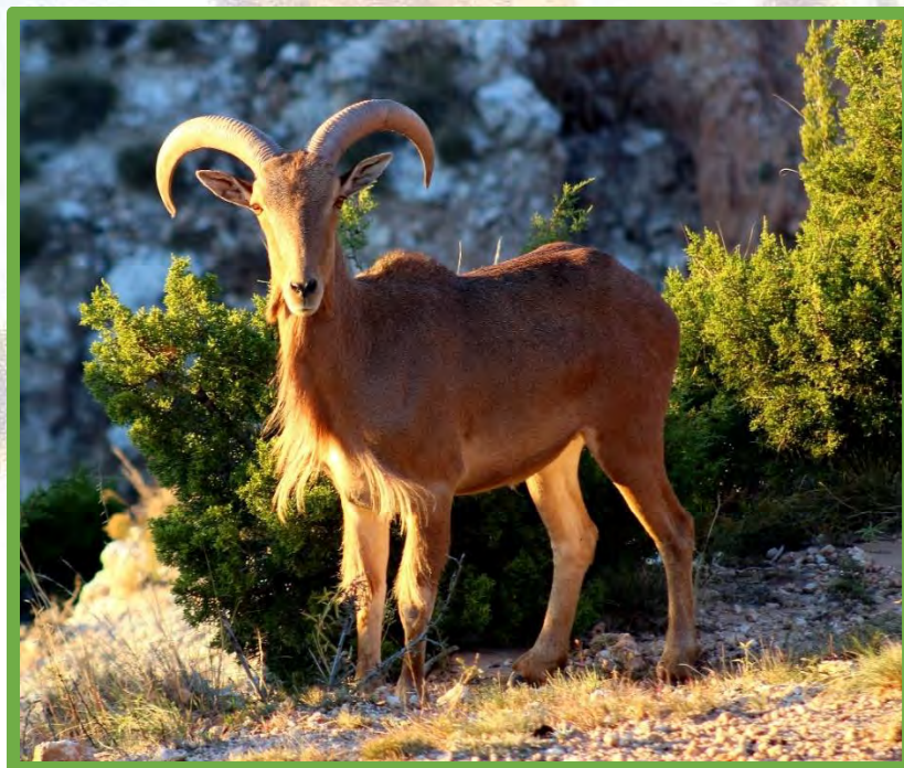
Aoudad, Exotic Species