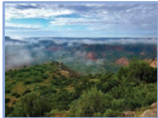
Foggy Morning

out of touch with silence and suppression of self, rarely content to be only a small part of all that is.